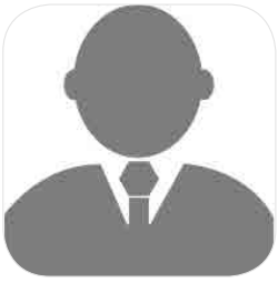
MINISTRY OF ENERGY Representative